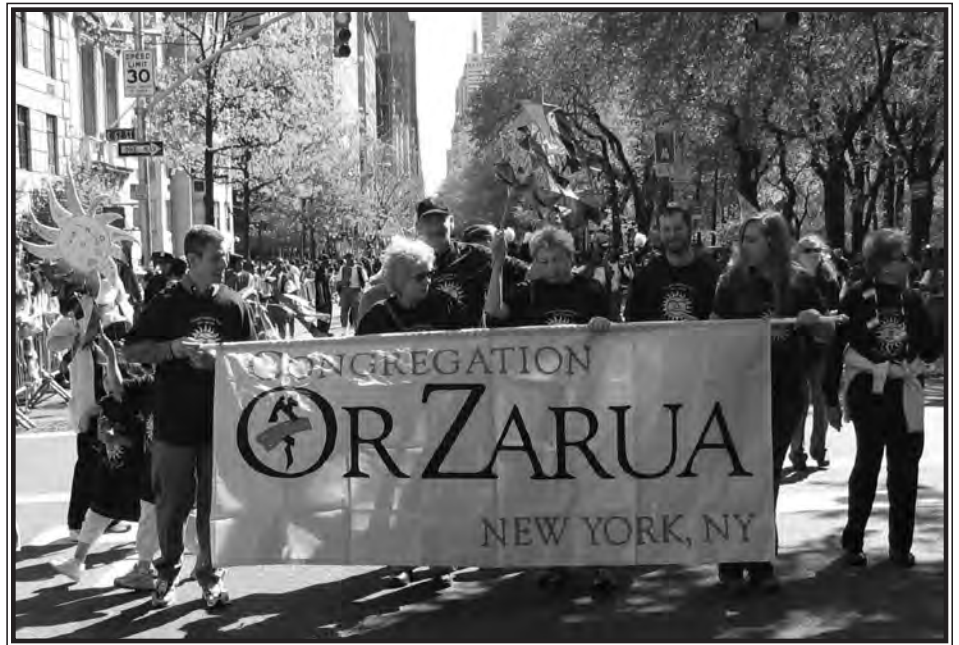
OZ's brightly colored decorations received special recognition at the 2007 Salute to Israel Parade.

Participation in the parade on June 1 will mark our seventh year demonstrating the strength of our support for Israel.