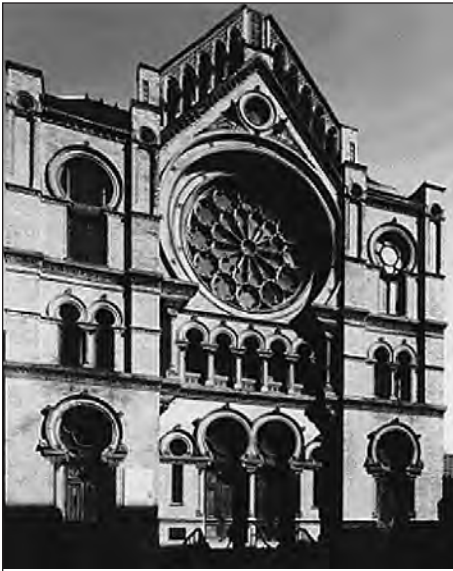
The facade of the Eldridge Street Synagogue combines Gothic, Moorish and Romanesque architectural elements.

the first great house of worship built on the Lower East Side by immigrant Jews from Eastern Europe. Since its opening in 1887, the building has been a symbol of the religious freedom and economic opportunity sought by so many immigrants coming to America. It is the most significant remaining marker of the huge Jewish community that flourished on New York's Lower East Side from the 1850's to the 1940's. Members included Eddie Cantor, Paul Muni, and Edward G. Robinson.