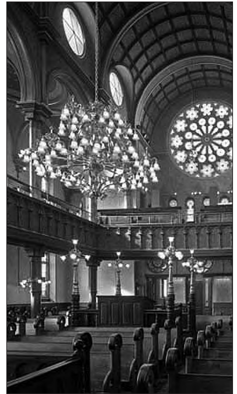
The Eldridge Street Synagogue has been restored to its original grandeur while preserving traces of its century-long existence.