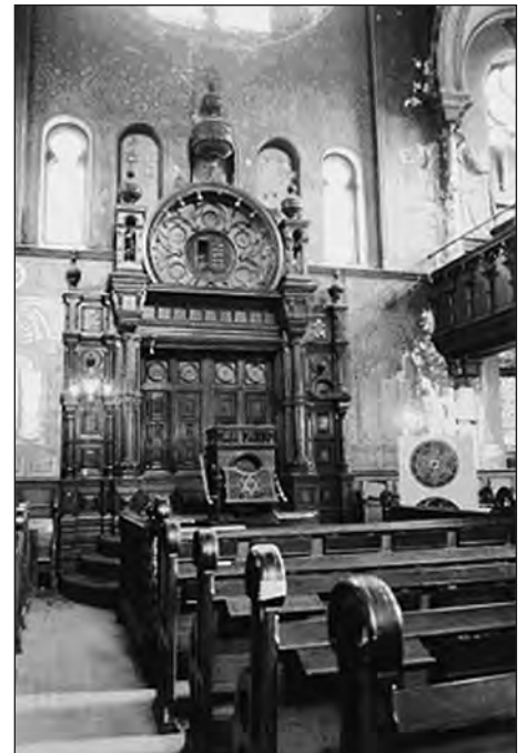
The Holy Ark, made of hand-carved walnut, is large enough to hold 24 Torah scrolls.