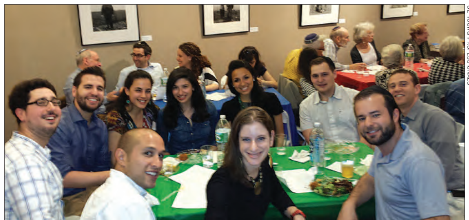
OZ YOUNG PROFESSIONALS

Young Professionals will lead Shaharit with the entire Congregation. Please contact us if you are interested in leading services,