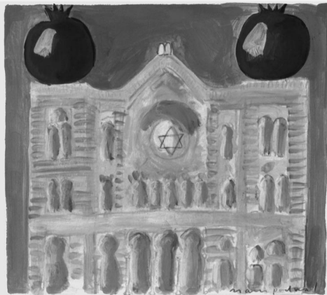
THE JERUSALEM SYNAGOGUE IN PRAGUE