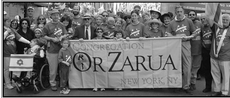
Or Zarua members gathered to march in last year's Salute to Israel Parade.

wonderful event and a great chance to show our support for Israel!