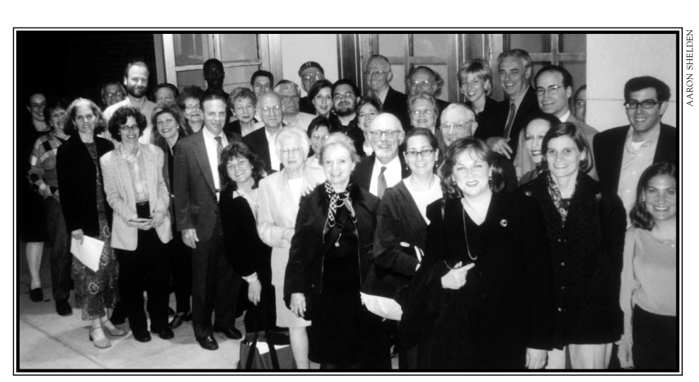
OZ Congregants gathered in front of the synagogue on May 20th following the Annual Meeting and the installation of an outdoor mezuzah in a specially designed enclosure.