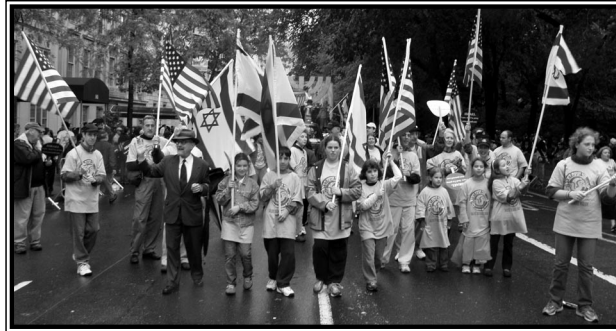
Or Zarua marchers in last year's Salute to Israel Parade.

visit Israel. Each marching group will depict a place or an activity as