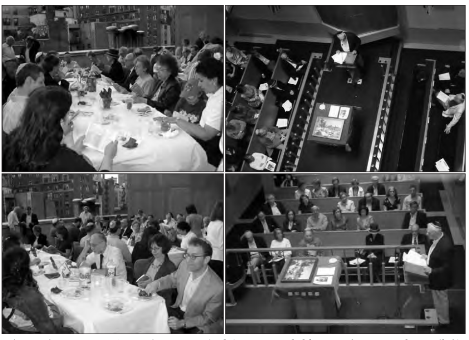
The 18th Or Zarua Annual Meeting (right) was preceded by a rooftop picnic dinner (left) and followed by a Yom Yerushalayim program in the sanctuary of music and reminiscences.