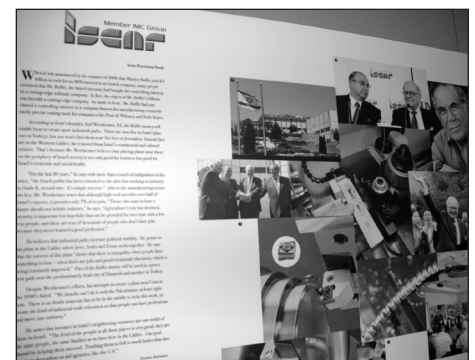
Iscar Limited Precision Tools

This is truly an inspiring story: how Israel has gone from its Biblical promise of bounty to a strong modern nation brimming with brainpower, achievement, commercial success, and technological/intellectual leadership.