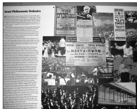
Israel Philharmonic Orchestra

In six decades, Israel has built transportation giants on land, sea, and air; established world-renowned cultural and