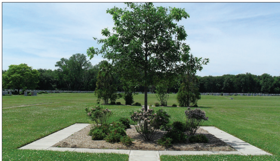
Views of the Or Zarua cemetery section of Beth El Cemetery.