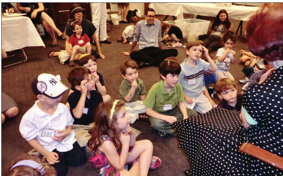
02 EDUCATION DEPARTMENT