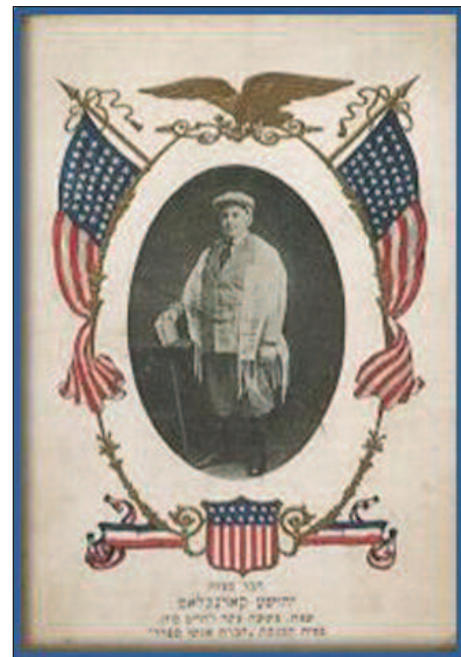
An invitation to a Bar Mitzvah from the early 1900s.