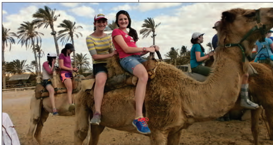
Riding camels in the Negev

7:00 a.m. Shaharit 8:00 p.m. Minhah/Ma'ariv