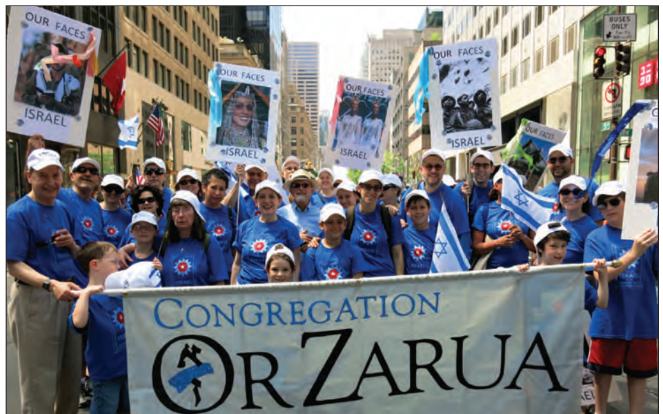
CELEBRATE ISRAEL PARADE, SUNDAY, JUNE 2. Approximately 60 Congregants and OZ Youth had a great time marching along Fifth Avenue on a beautiful day to show their support of Israel. White parade caps emblazoned with our shul's name are available for an $18 donation. Call the office at 212-452-2310, extension 12, to obtain one.