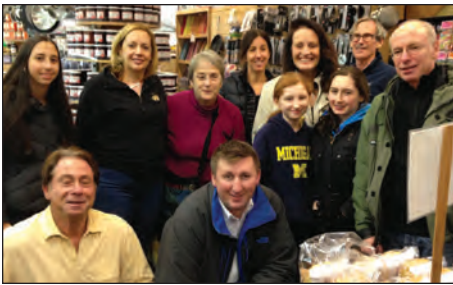
Thanksgiving gleaners collecting food at The Vinegar Factory.