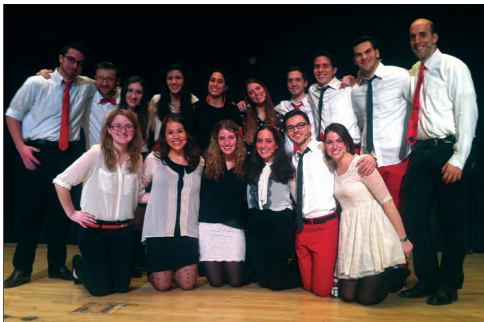
TIZMORET , a professional Jewish a cappella group from Queens College Hillel, will perform at Or Zarua for Shabbat Shirah, January 10–11, 2014.

We will welcome Shabbat Shirah, together with the members of Tizmoret, beginning with Kabbalat Shabbat followed by a festive dinner (reservations required). On Shabbat morning, Tizmoret will perform during the time usually reserved for the D'var Torah. After kiddush, we will return to the Sanctuary, at about 1:30 p.m., for a concert. The concert is open to the public, so please invite your friends and neighbors. Following the concert, Tizmoret will meet with the youth of OZ.