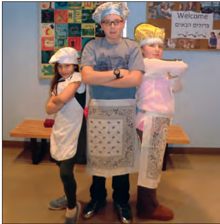
Laughing Latkes competed in Top Latke.

E ach year, OZ Hebrew School students are encouraged to perform different mitzvot. We collect money for a school in S'derot and toys for Chai Lifeline, which helps sick kids, and make decorations for