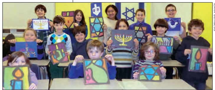
Preparing art for the Ronald McDonald House Share-a-Night event