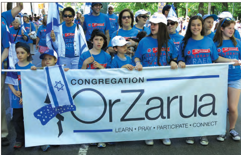
OZ youth leadership heading OZ's parade contingent.