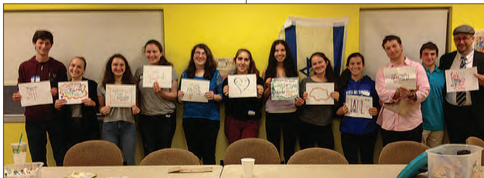
Teen Beit Midrash