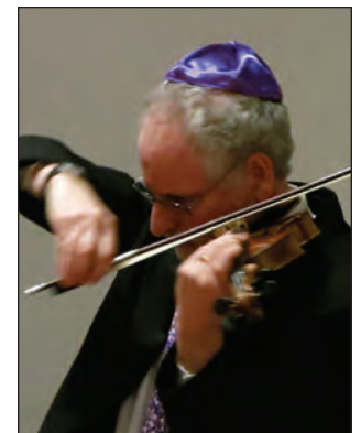
YOM HA'SHOAH MEMORIAL SERVICE. Members of Congregation Or Zarua, including students from the Youth Education Department, led a Holocaust Remembrance Service on Sunday, April 27, with prayer, music, and candlelighting. We remembered those who endured and those who perished in the Holocaust with a reading of names.