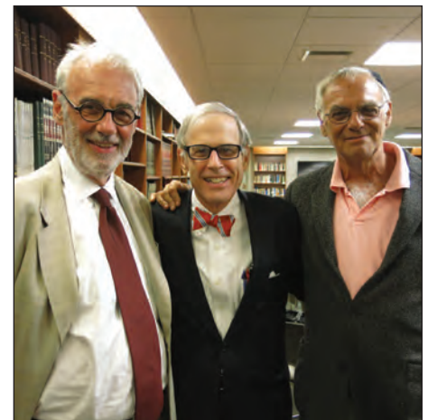
Talmud class members