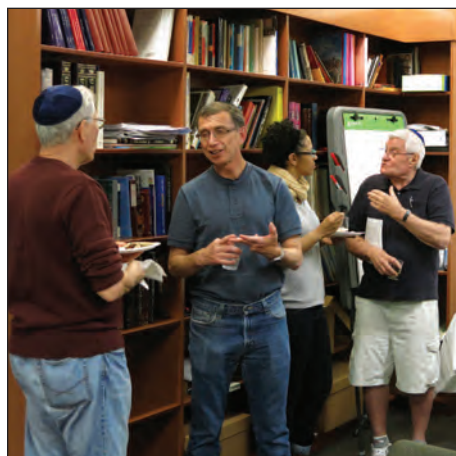
Talmud class celebrated with a Siyum.