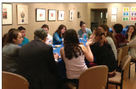
Teen Beit Midrash