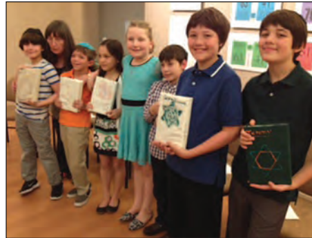
Students display their decorated siddurim.