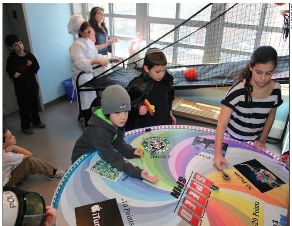
Children playing games during Or Zarua's Purim carnival.