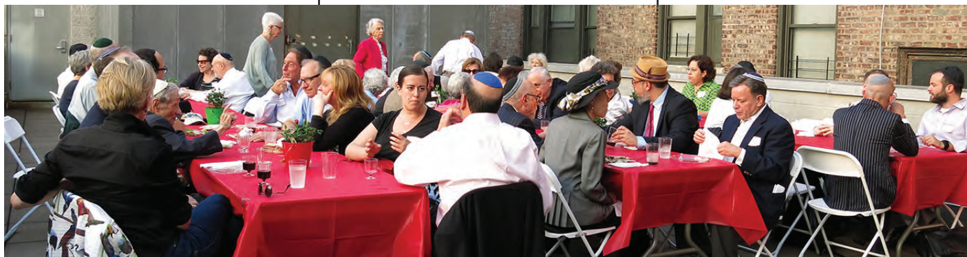
SPRING PICNIC ON THE ROOF. Or Zarua offers a variety of programs, including rooftop events, where you can learn, pray, participate and connect. Read through this newsletter to discover some of the events scheduled for this summer and fall including lectures, classes, services, and Or L'Atid youth programs.

Praying with community is inspiring, and enjoying a bagel and coffee afterwards is always a good way to start off a day. Please be part of our ongoing daily service. Getting up to make the minyan is worth it! Watch for Rosh Hodesh and Hol Hamoed for the chance to sing Hallel. On Mondays and Thursdays we read the Torah. Join the minyan at OZ: Take time to reflect and help provide the required minyan for those saying kaddish.