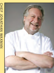
CHEF JONATHAN WAXMAN

T here are still tickets available for OZ's social event and fundraiser, "A Taste of Spring" with Chef Jonathan