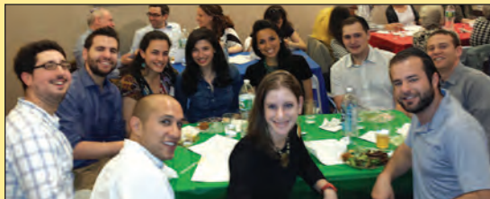
OZ's Young Professionals enjoying last year's Lag B'Omer celebration.

REPRODUCED WITH THE COOPERATION OF THE ARTHUR SZYK SOCIETY, BURLINGAME, CA. WWW.SZYK.ORG.