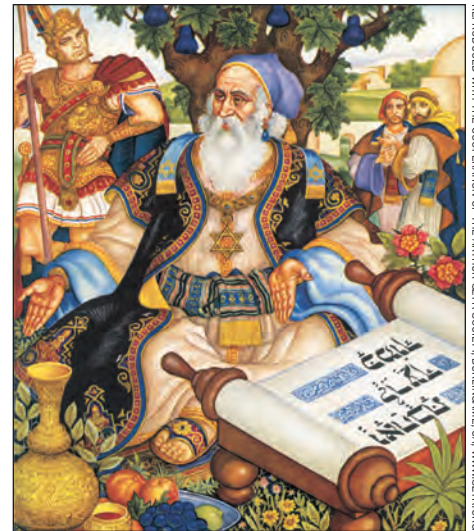
“Hillel” by Arthur Szyk

REPRODUCED WITH THE COOPERATION OF THE ARTHUR SZYK SOCIETY, BURLINGAME, CA. WWW.SZYK.ORG.