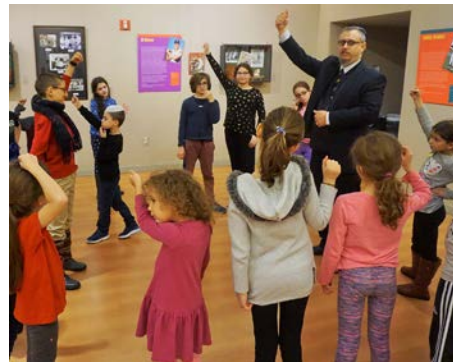
Our Hebrew Schoolers celebrated Hanukkah together with their parents, learning all about the true miracle of Hanukkah—that the Maccabees prevailed and preserved Judaism. Students and parents thought about what aspects of Judaism they'd fight hardest to preserve. Each group wrote down their ideas on candles, and together we made a Hanukkah!