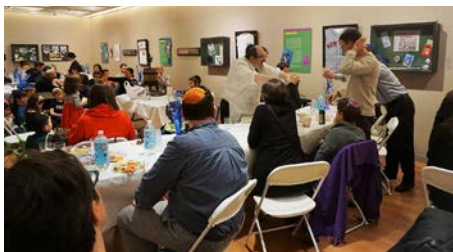
Above: Kids of all ages and adults had a blast as we celebrated Hanukkah together with story time, Havdalah, candle lighting and dinner. Then, while our Middle Schoolers headed out for a fun night on the town, the rest of the group made olive oil, which we lit in a Hanukiah!