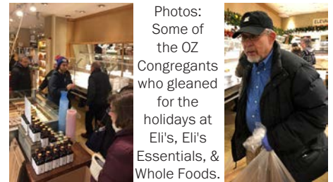
Photos: Some of the OZ Congregants who gleaned for the holidays at Eli’s, Eli’s Essentials, & Whole Foods.