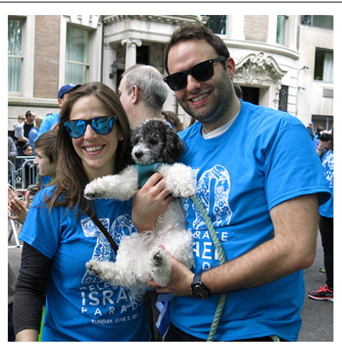
About 90 Congregants and one puppy represented Or Zarua in this year's Celebrate Israel Parade. If you missed it, you can see OZ in the official video here: http://celebrateisraelny.org/parade-video/ Please join us next year on Sunday, June 2.