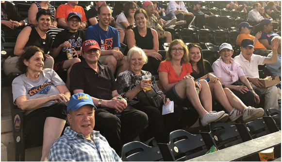
OZers had a great time at the Mets game! Despite the Mets' loss, everyone enjoyed the kosher hotdogs, beautiful weather and great company!