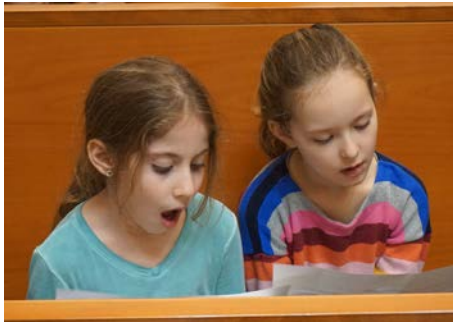
Above: Students continue to excel in t'filah, leading and participating with ru'ah. Right: 3rd-4th Grade students plant seeds in conclusion of their unit on and in celebration of Tu B'Shvat.