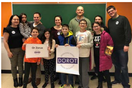
Above: Or Zarua volunteers participated in Dorot's annual Passover package delivery for seniors on Sunday, March 18, bringing treats and companionship before the holiday.

“Thank you so much for helping us distribute groceries to seniors today at New York Common Pantry. Because of your help we were able to help serve 169 seniors! I was told by the staff downstairs that this is the fastest we have ever finished senior grocery distribution! Thank you so much for all of your assistance today, I hope you can join us again in the future.”