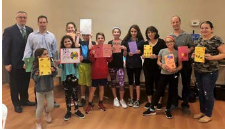
Above: On Columbus Day, Families made Thanksgiving cards for older adults of DOROT.