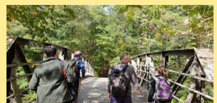
Or Zarua's Young Professionals Hiking in the Mountains, October 2018