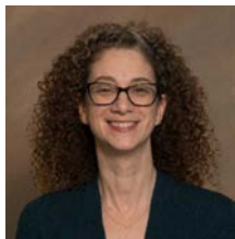
of Religion Studies and Director of the Jewish Studies Program at Muhlenberg College, whose scholarship focuses on modern Jewish history,