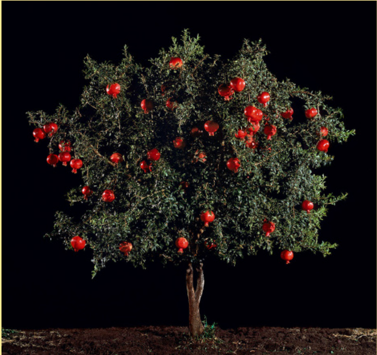
Image by Tal Shochat, Rimon (Pomegranate) 2010, C-Print, 47.25 x 50.75 inches.