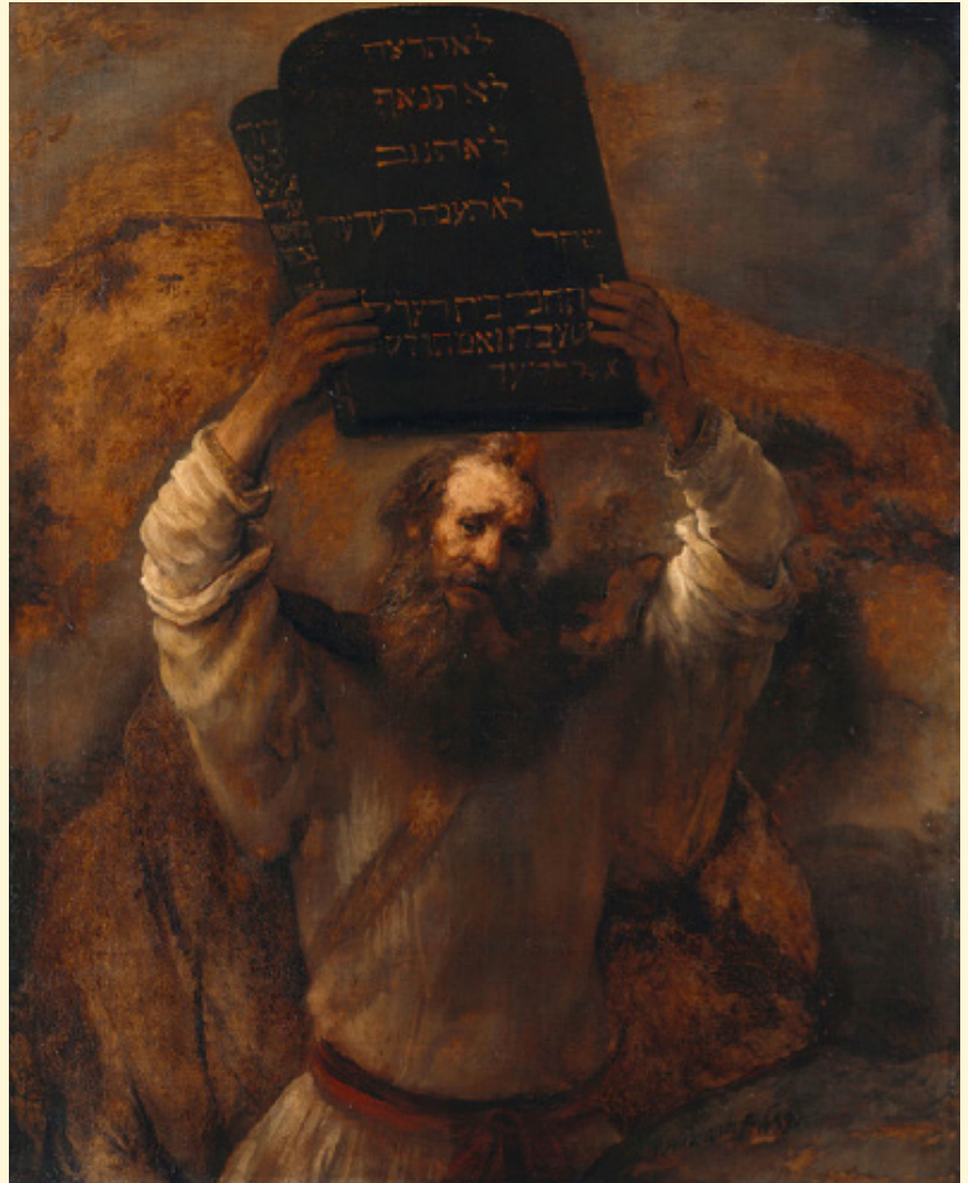
REMBRANDT VAN RIJN

From the OZ Gallery Committee, Chag Shavuot Sameach!!