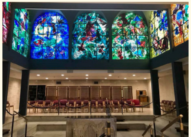
(Top ) Marc Chagall, Hadassah Hospital, Jerusalem, southern view –Naphthali, Joseph, Benjamin-three of the 12 stained-class windows; (Middle) Chagall windows seen from outside; (Above) Ein-Kerem Synagogue of Hadassah University Hospital.