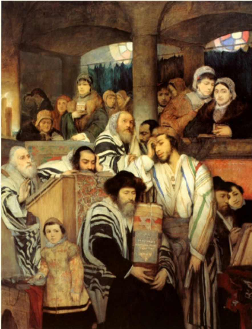
Maurycy Gottlieb Jews praying in the Synagogue on Yom Kippur, 1878 Tel Aviv Museum of Art.

These are the days of reflection and introspection, a period of deep, personal and complex emotions. We ask ourselves, "What have we done with our lives in the past year and what do we need to do better? How will we be judged and will we be forgiven for our transgressions? What fate will be sealed in the Book of Life?" Although we meet and pray as a community, our thoughts are mostly of ourselves and those closest to us. How does an artist convey and portray this emotional churning?