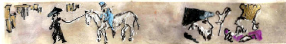
Ahasuerus asks Haman what he thinks should be done for such a person who the king wants to honor; Haman answers that such a man should be led on a white horse through the kingdom (which Haman must then do for Mordechai).