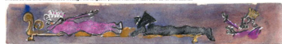
Ahasuerus shocked to find Haman prostrate on the couch upon which Esther is lying.