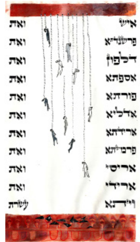
The ten sons of Haman put to death, their hats on the ground below.