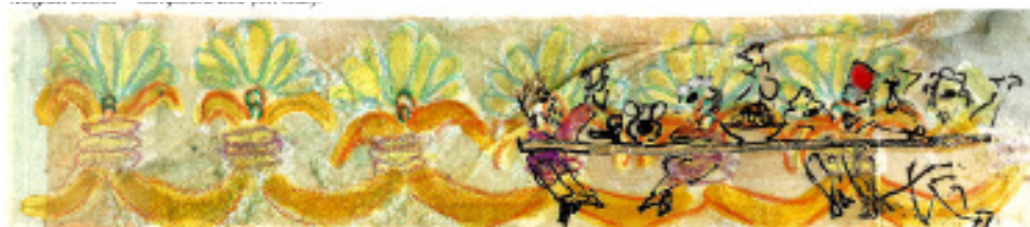
The first feast.