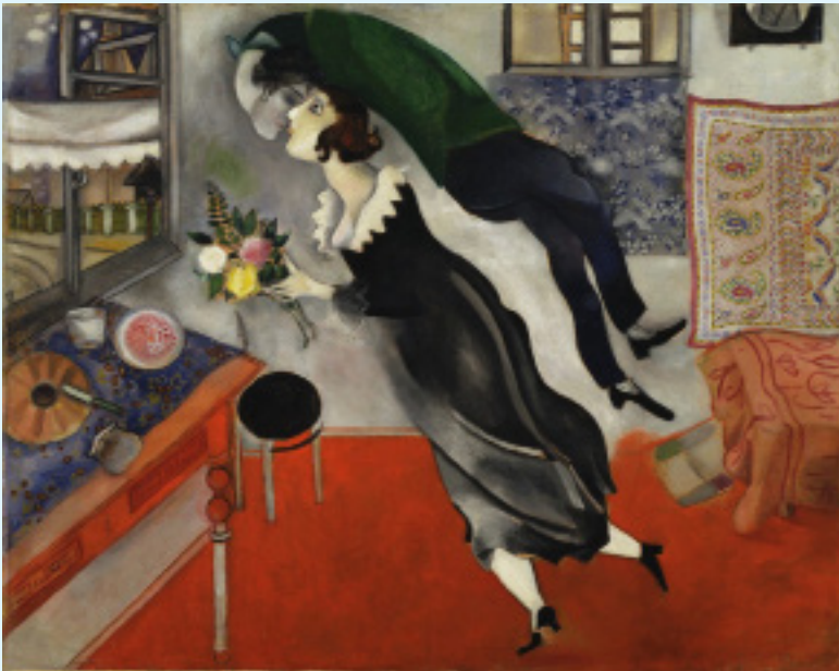
Marc Chagall, Birthday , 1915 Oil on cardboard Museum of Modern Art (MoMA), NYC