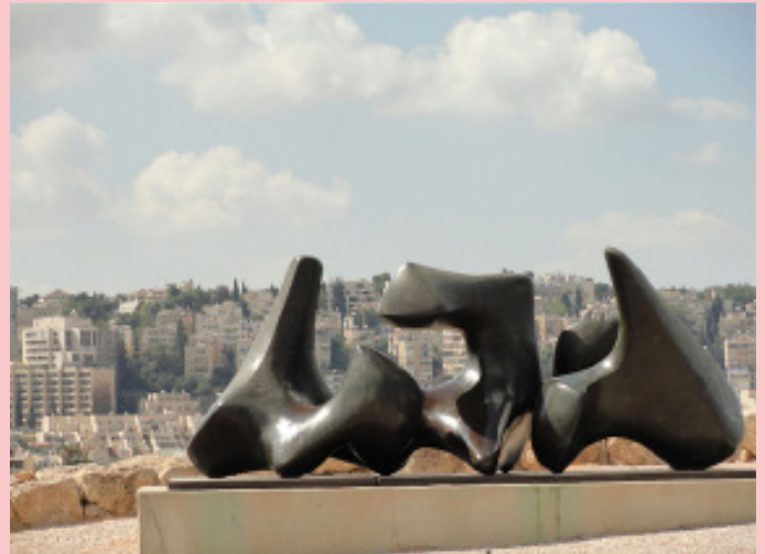
Henry Moore Three Piece Sculpture: Vertebrae Billy Rose Art Garden, Jerusalem

The Eretz Israel Museum was established in 1953 on an archeological site dating to the 12th century BCE. Its 20-acre campus in the Ramat Aviv district overlooks the center of Tel Aviv. Surrounded by native trees, shrubs and flowers (natural and man-made, such as these above) the Museum has displays relating to archaeology, Judaica and the history and culture of arts and crafts dating back centuries.