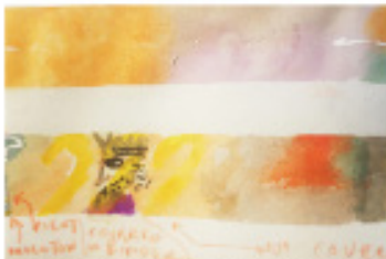
Testing paints & inks on k'l sample and mixing new colors of egg tempera.