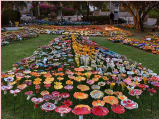
Collaborative Effort Ceramic flowers installation from 2017 Eretz Israel Museum, Tel Aviv