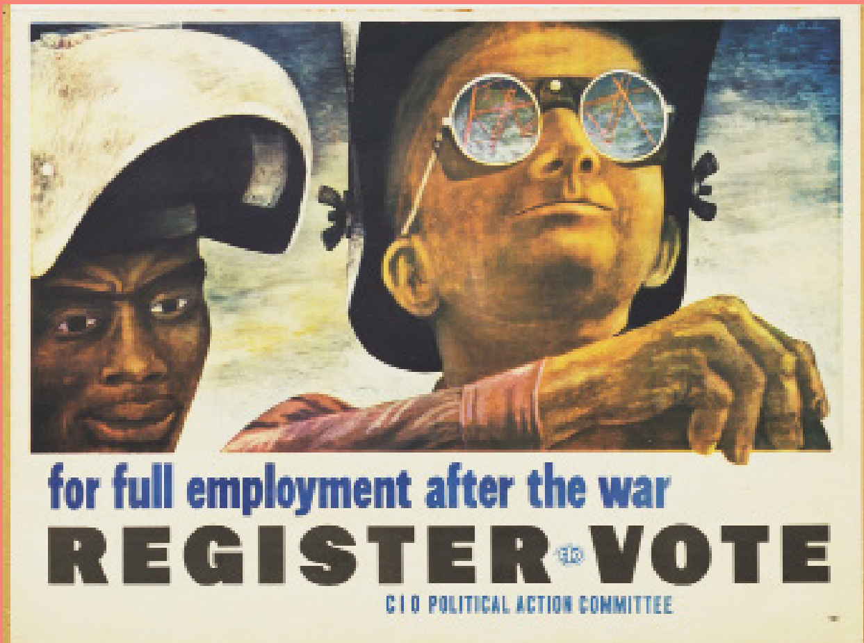
Ben Shahn, Welders, For Full Employment After the War, Register, Vote. 1944 Gift of the CIO Political Action Committee. MoMA (Museum of Modern Art), New York City