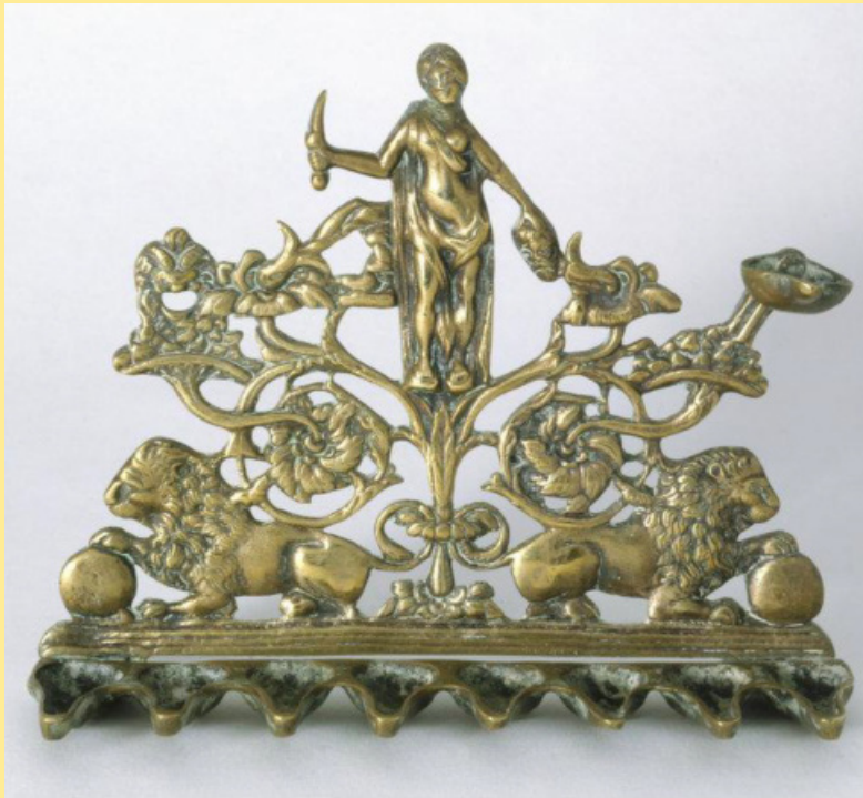
This Hanukkah lamp, made in Italy in the 19th century, depicts Judith holding a sword in one hand and the severed head of Holofernes in the other.

From the collection of The Jewish Museum, New York