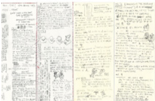
Notes taken on the Malbim.