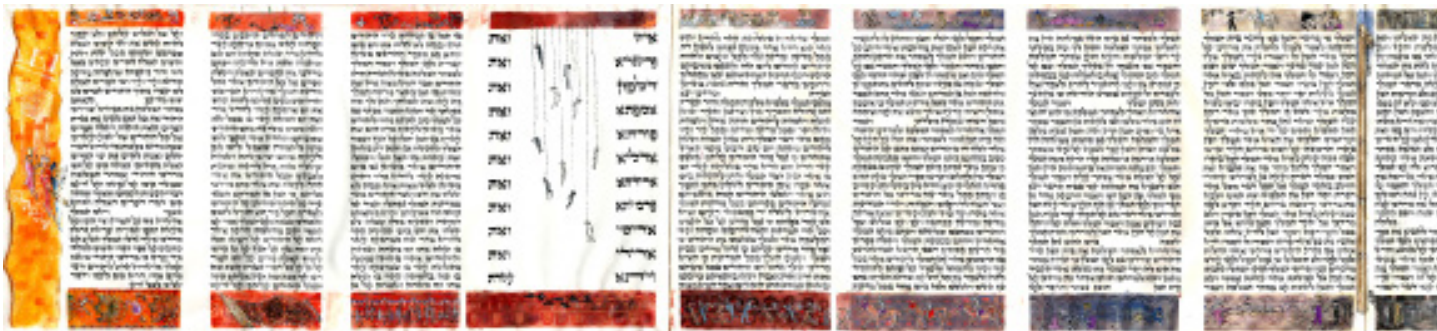
Megillah Esther - completed work (right side).