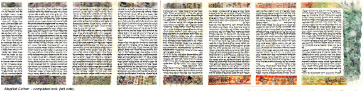
Megillat Esther - completed work (left side).