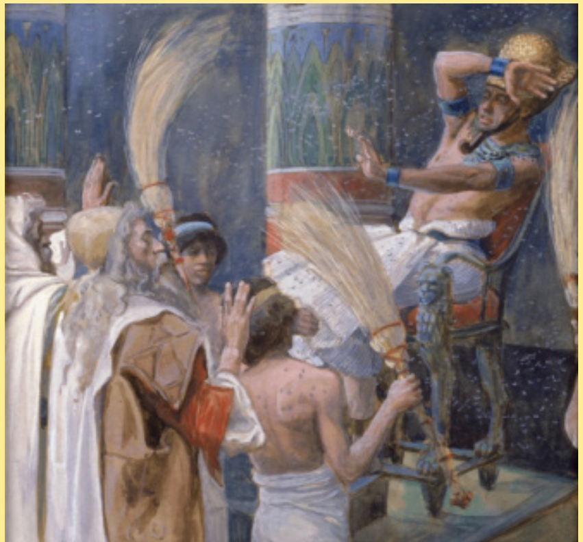
James Jacques Joseph Tissot

Left: Water is Changed into Blood , c. 1896-1902