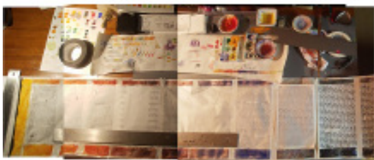
Painting patterned background panels before returning to apply the figures.