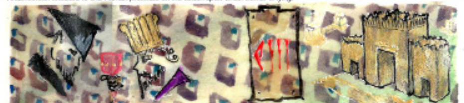
Outside the palace gates the document declares the date of the 13th in ancient Persian cuneiform; Ahasuerus & Haman drinking together.