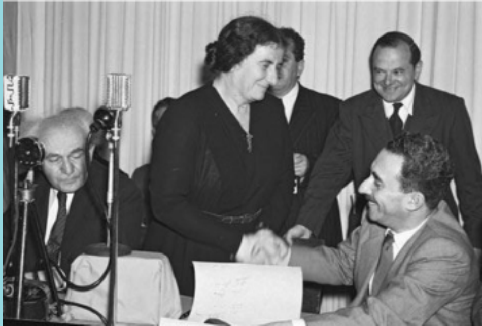
Photograph Taken after Signing the Declaration of Independence of Israel, May 14, 1948