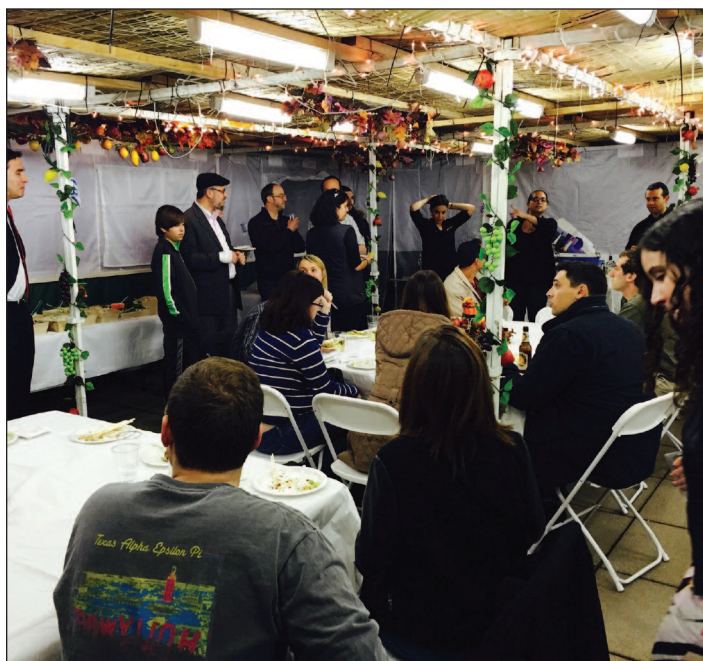
Nearly 50 of OZ's Young Professionals attended the annual Sushi in the Sukkah dinner on Sunday night of Hol Hamoed Sukkot.

Or Zarua Young Professionals (OZYP) is a group in their 20s and 30s committed to building a welcoming and vibrant Jewish community within Or Zarua. They hope to continue to grow the group with other young professionals who are excited about celebrating their Judaism.