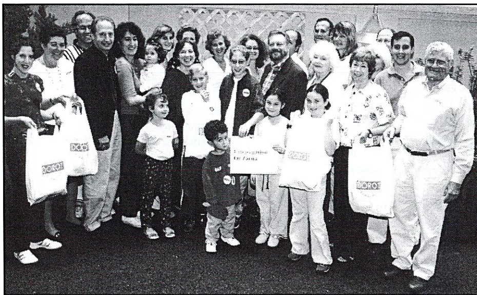
Or Zarua congregants preparing for the DOROT food delivery and visits held on September 24, 2000

The Talmud class is free to members and nonmembers alike, and may be joined at any time. No knowledge of Hebrew or Aramaic is required; nor is attendance at last year's class required.